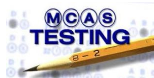
Roger Clap MCAS Testing Dates